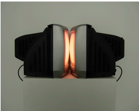
Kelly Mark The Kiss , 2007

The exhibition will travel to Casino Luxembourg - Forum of Contemporary Art in January 2019.