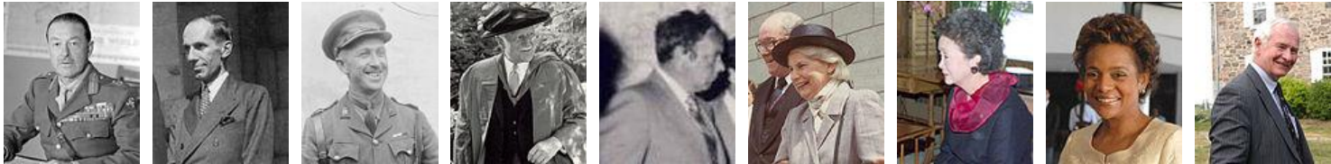
The Viscount Alexander of Tunis; Vincent Massey; Georges Vanier; Roland Michener; Jules L ger; Edward Schreyer; Jeanne Sauv ; Ray Hnatyshyn; Rom o LeBlanc; Adrienne Clarkson; Micha lle Jean; David Johnston.