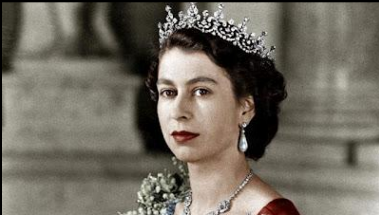
QUEEN ELIZABETH II